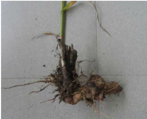
<<< Rhizomes : Photo H0003

Like us on Facebook: Tal-Hsajjar Decorator.