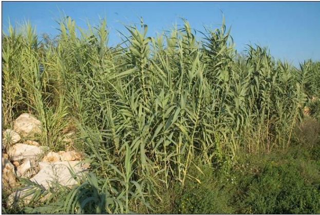
Immature Arundo donax, (Giant Cane)

Tal-Hsajjar Decorator is also studying the process of making the reed wastage into Solid Biofuel such as BBQ tablets or fire pallets and Biogas products.