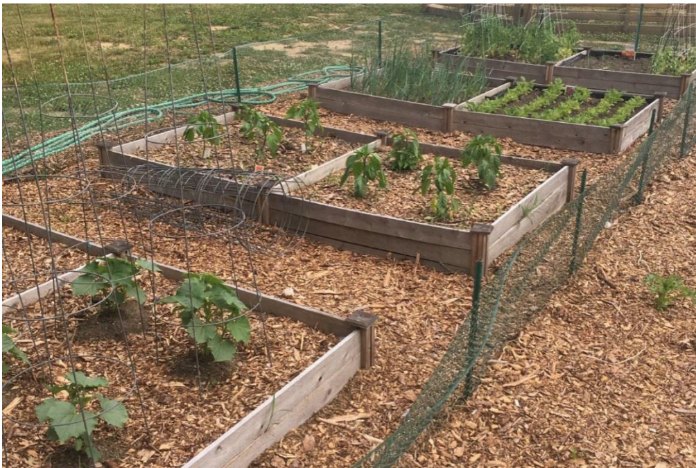
Mulch Mixture: 10% Wood & 90% Shredded Cane (left Overs from manufacturing). This is photo taken during testing & sampling